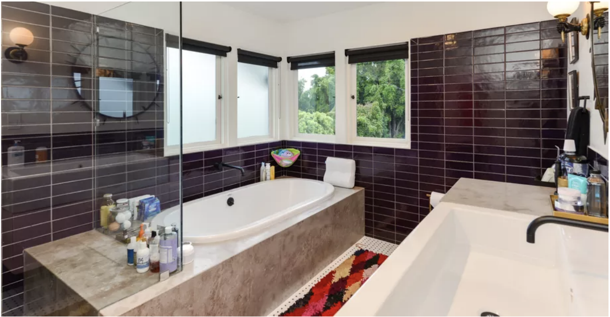
The master bath was revamped with designer tile and a poured cement soaking tub.