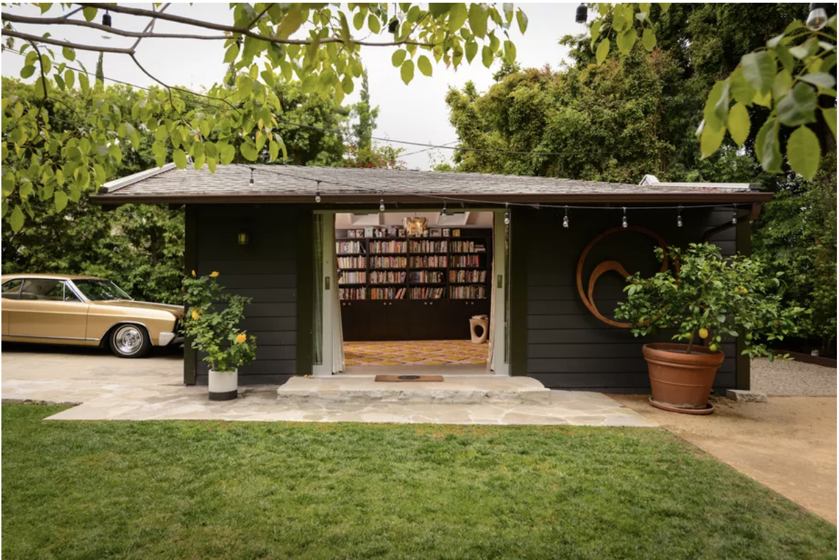
The garage was converted into a garden studio with half-bath.