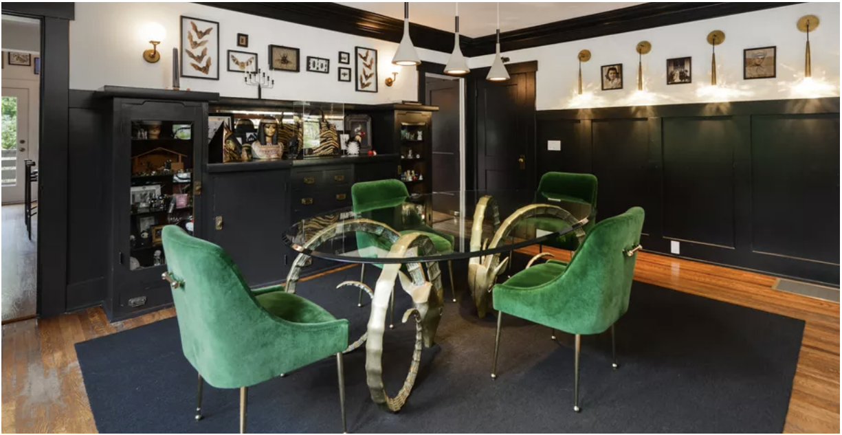
The dining room's standout feature is its sizable built-in buffet.