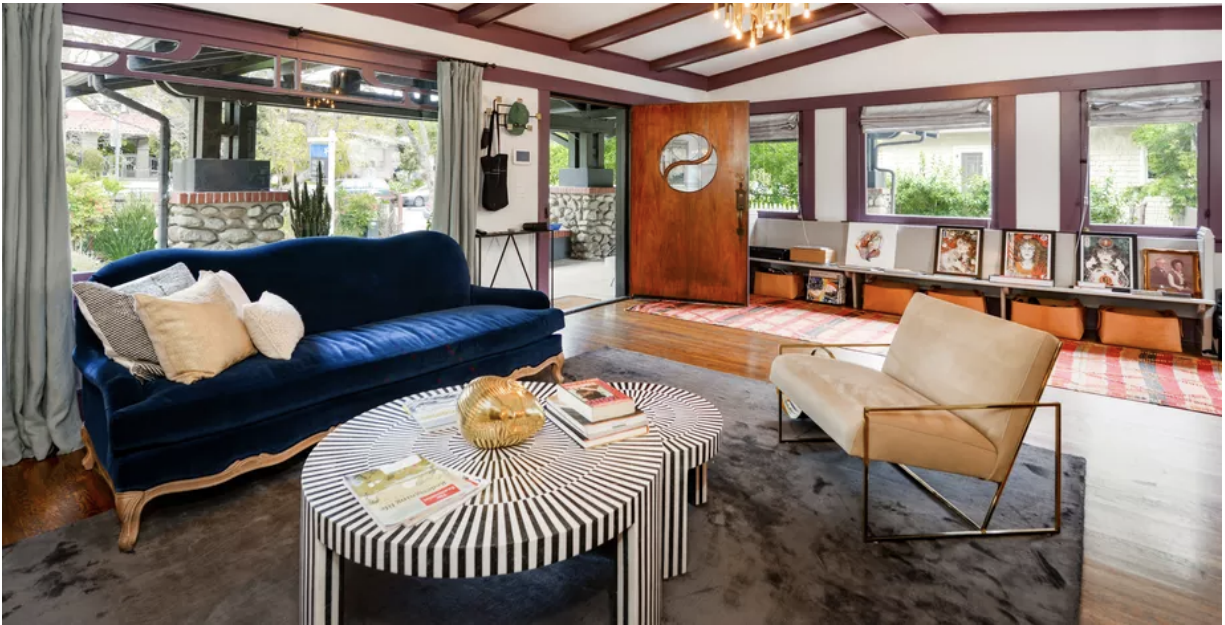
A Japanese influence can be seen in the bungalow's roof, front door, and window detailing.