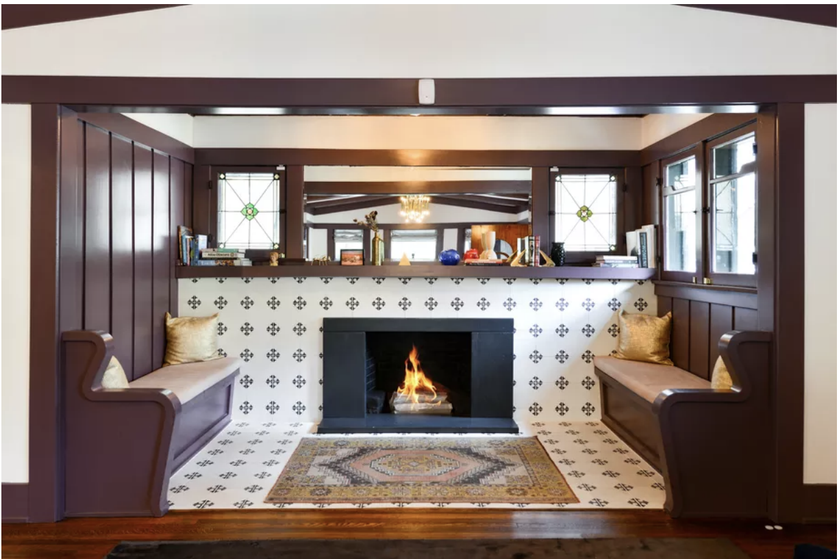
The tile around the inglenook fireplace is recent, but the leaded art glass is original.