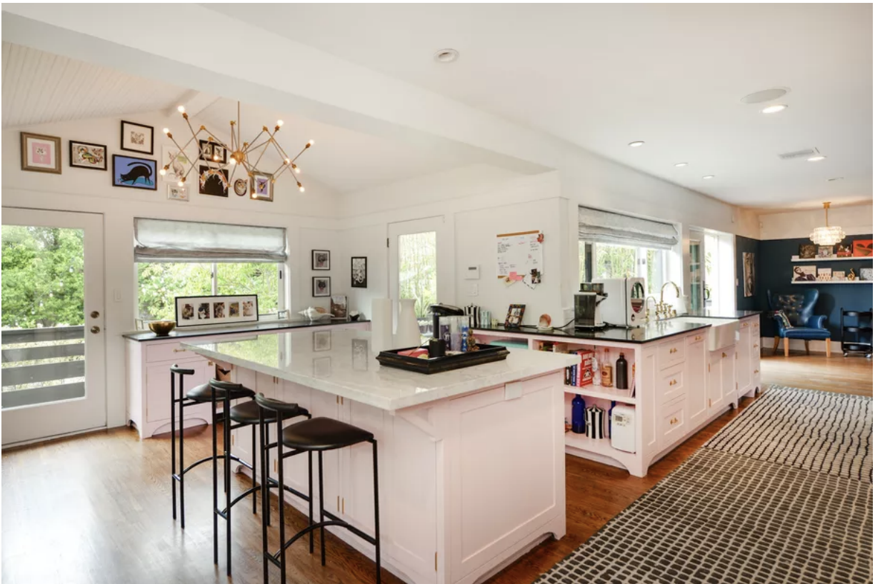
Multiple glass doors lead from the open-plan kitchen to a spacious patio deck.