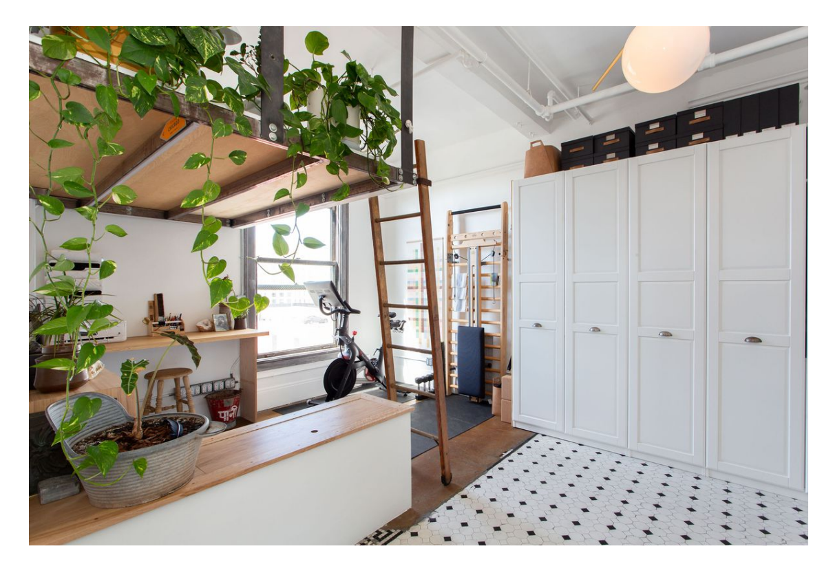
The office has a lofted bed.