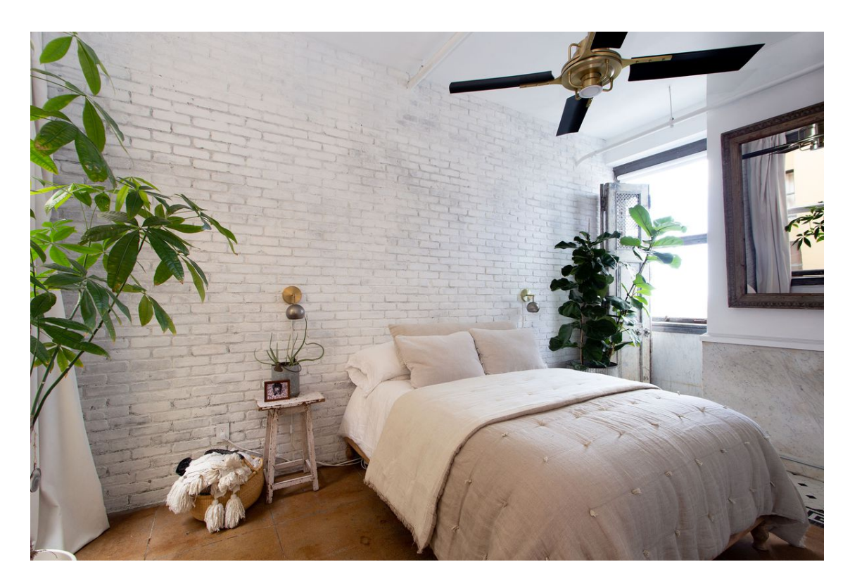
The master bedroom.