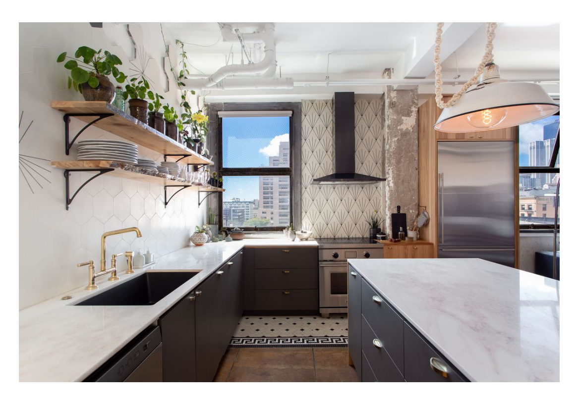
Marble accents in the kitchen make it extra-classy.