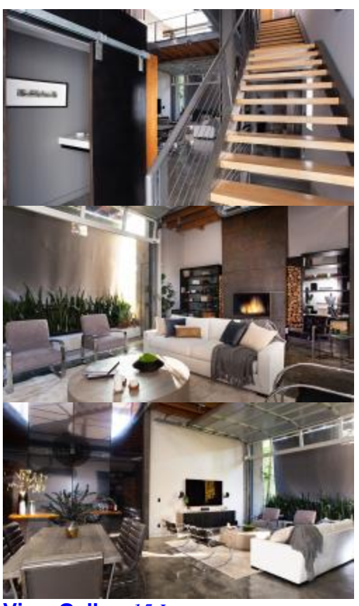
View Gallery 15 Images