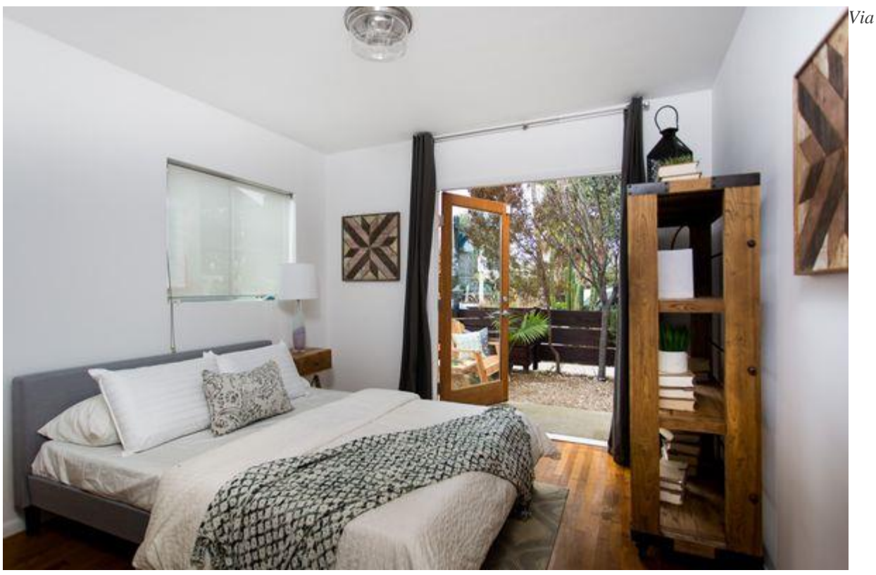
Jonathan Pearson, Halton Pardee

Moving over to the Westside, here's a swank little bungalow near Ballona Creek in Del Rey. Two bedrooms and a bathroom are tucked into its 704 square feet of floor space, with outdoor access in nearly every room. Interior features include wood floors, new cabinetry, stainless steel kitchen appliances, and glass doors. Sitting on a tiny 1,982-square-foot lot, the house nevertheless has some nice outdoor spaces. <u>It's asking $725,000</u>.