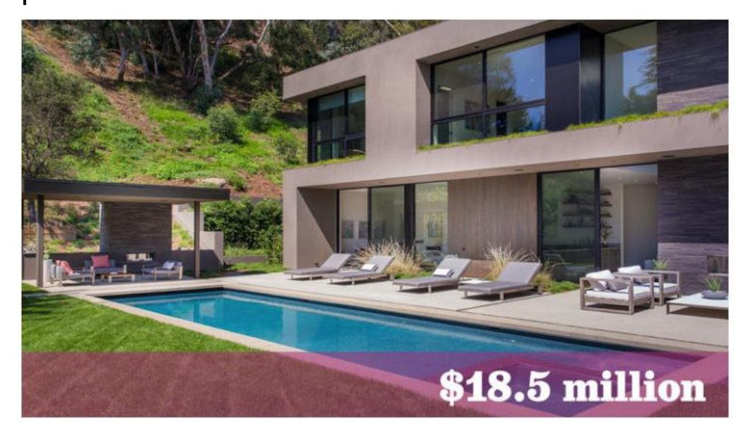
The 9,422-square-foot custom estate, designed by noted firm Marmol Radziner, has come on the market in Santa Monica for $18.5 million.