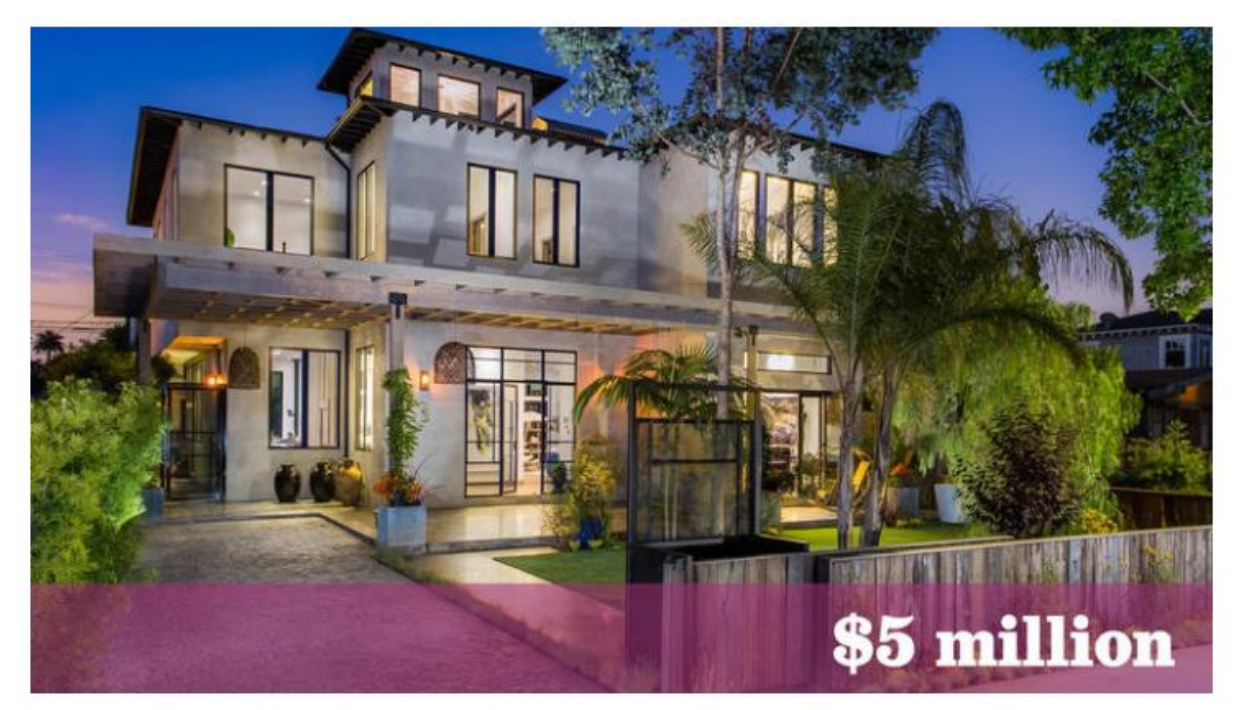
The Kim Gordon-designed home in Venice sold for $5 million, or $13,000 over the asking price. (Brandon Arant)