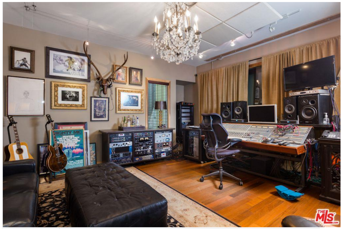
By Brie Dyas | Jun 13, 2017 6:00AM