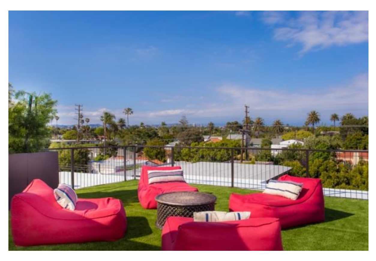
More: Go to the listing for additional images and details, plus an updated open house schedule.