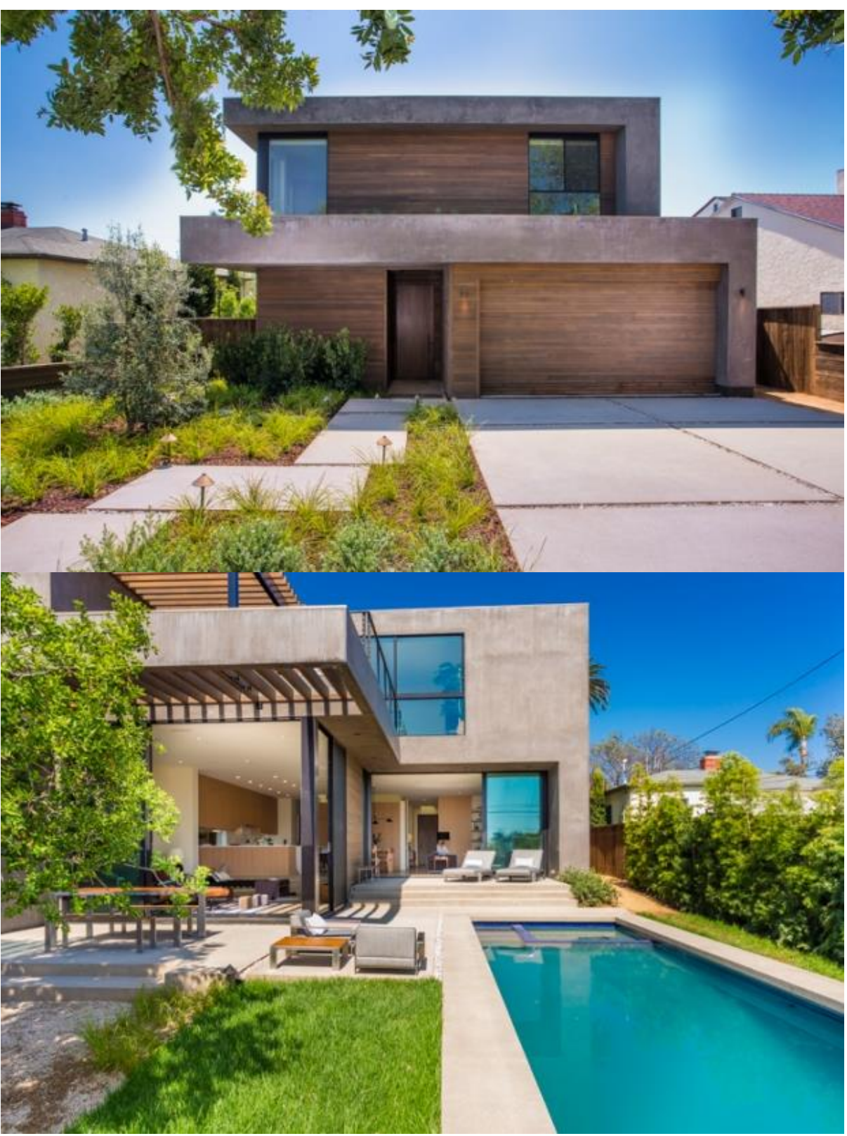
While Marmol Radziner's style is unmistakable, all of these properties look and feel custom built, as if tailored for a different imaginary client each time. The formula seems to be working. None of these properties stay on the market very long—this one has been on the market for less than three weeks and is on the brink of going into escrow. For the past few years, Mar Vista has been caught up in the