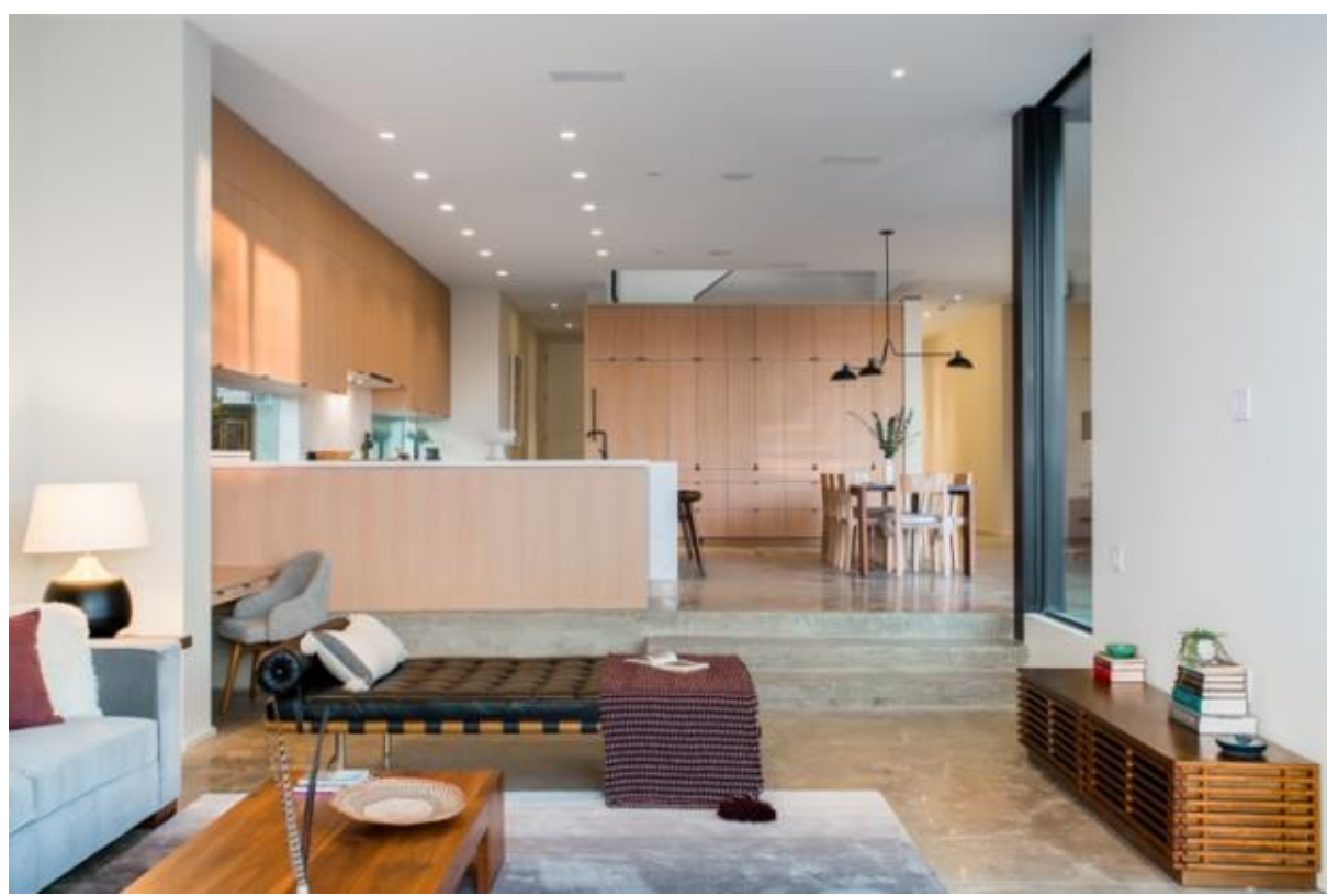
What We Love: The intimate second floor family room and deck, below.