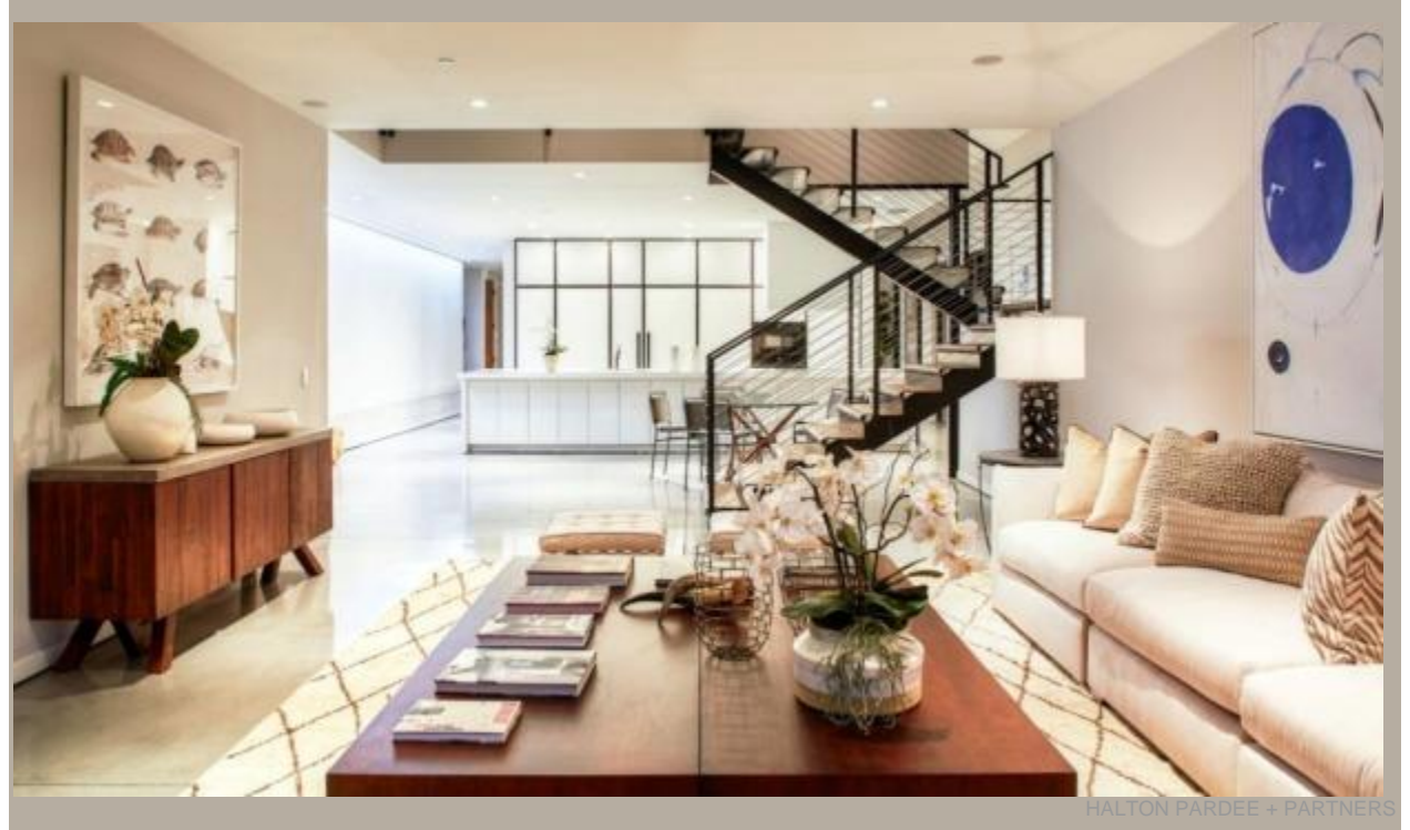
Mid-century furniture enlivens the living room.

The roof has a rainscreen, which provides a one-inch gap that allows hot air to rise and escape.