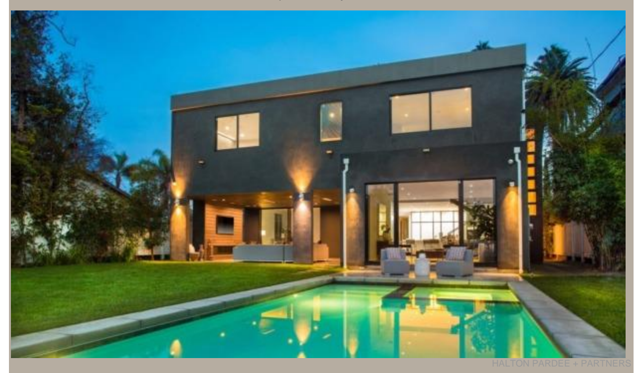
A large outdoor entertaining area is provided at the rear of the house.