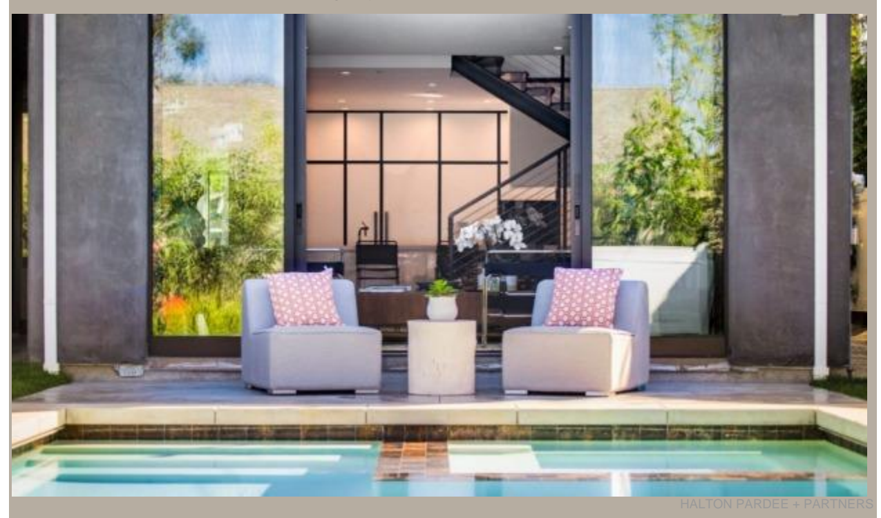
This setting could be straight out of Palm Springs.