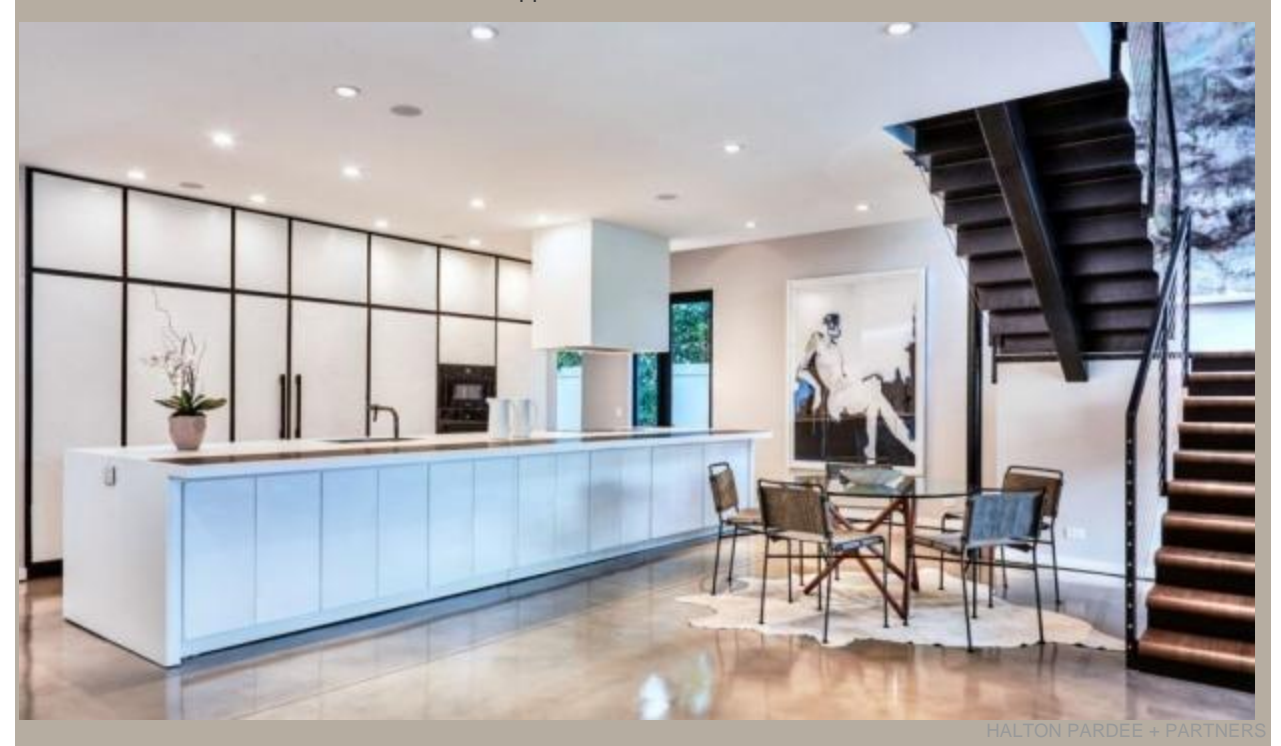
The sculptural steel and timber stairs are a feature of the open-plan living area.

Romano took the high-tech approach to the inside as well. The kitchen benchtops incorporate nanotechnology, so minor scratches can be buffed out with a little applied heat.