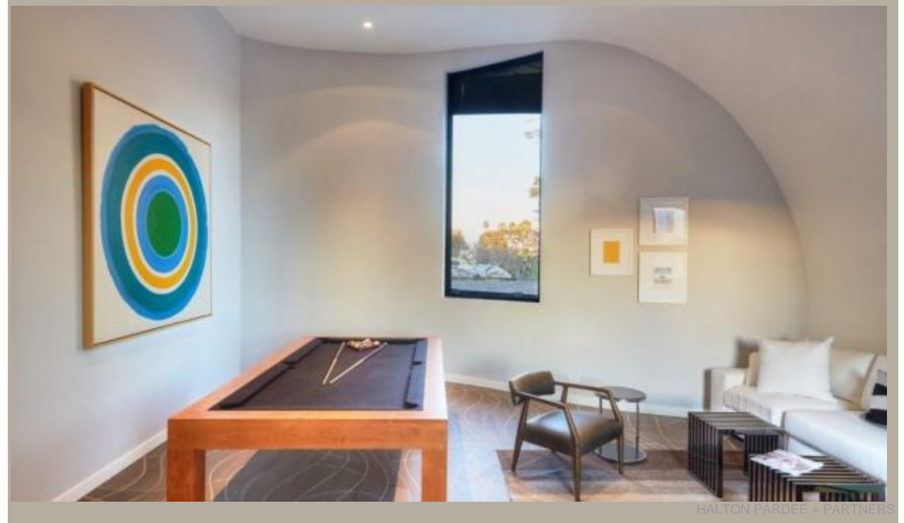
The walls follow the line of the roof to create intimate living spaces.