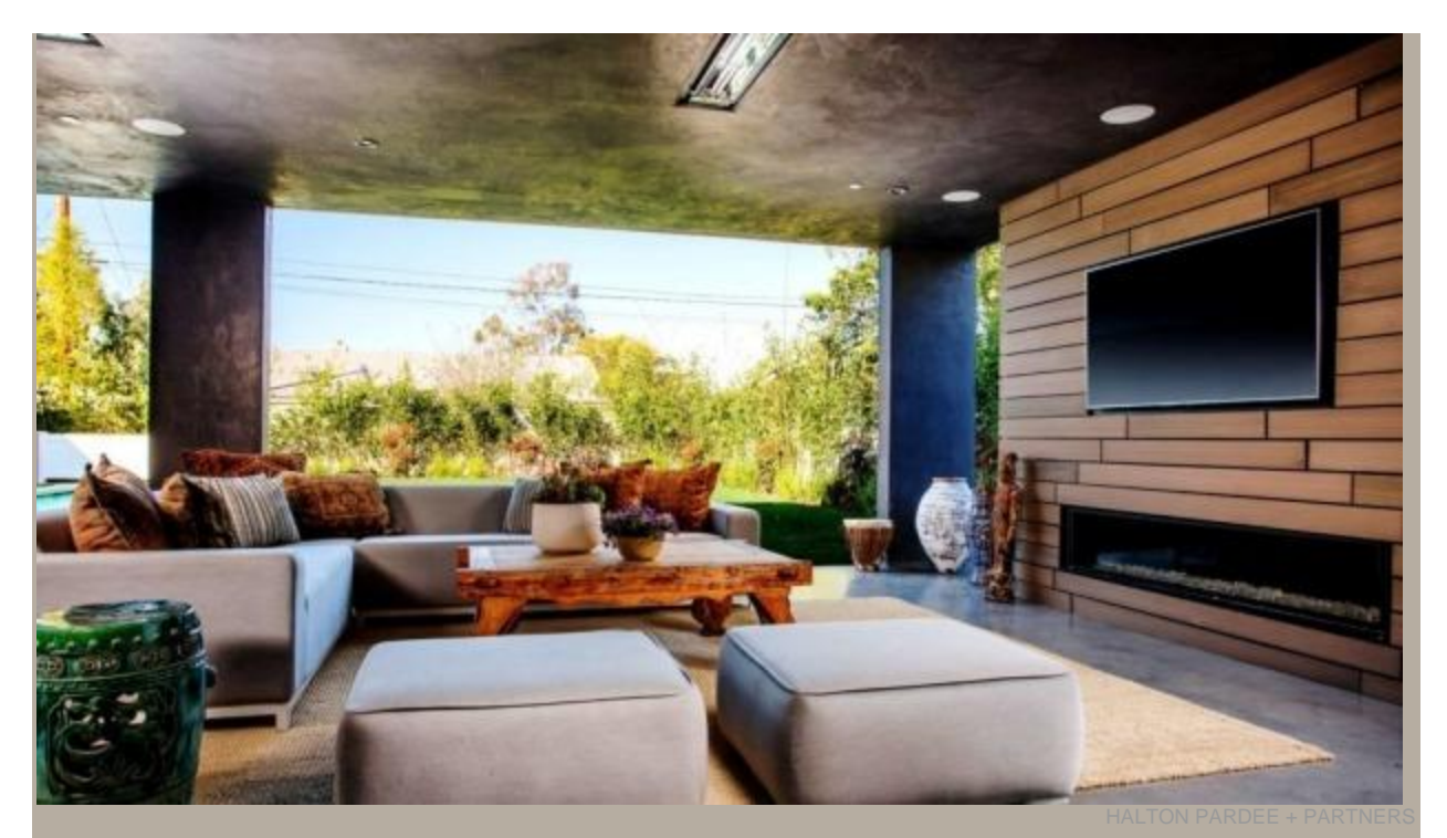
A covered outdoor cinema is another drawcard for potential buyers.