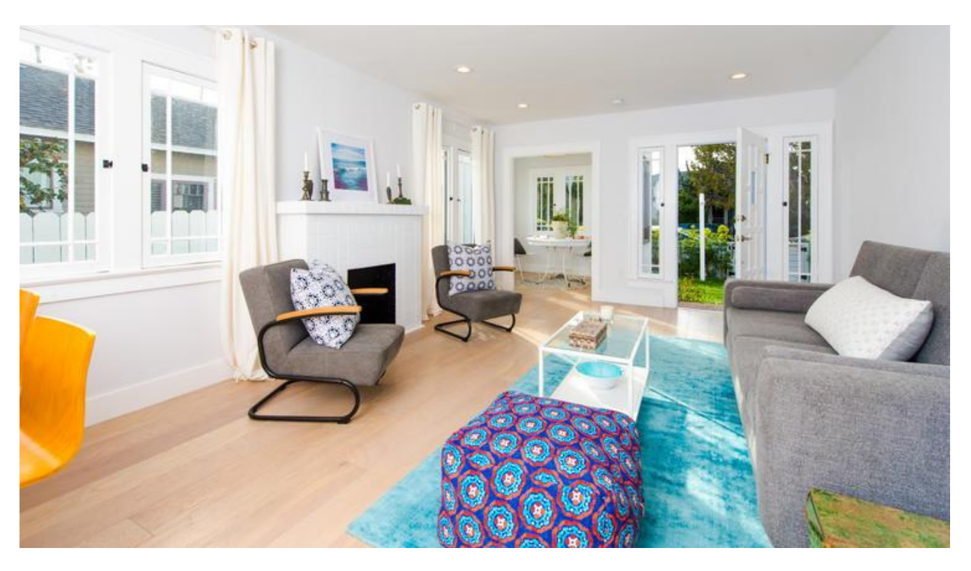
The side-by-side units retain their 1923 charm but have been updated for modern living. (Nils Timm)