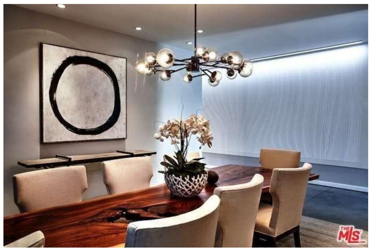
Corian wall in an undulating sand dune pattern

Corian walls, which are impervious to water, mold, and bacteria, function as the 'skin and sole of the house,' according to Romano. Their texturized patterns are inspired by nature, including tortoise shells, sand dunes, flocks of birds, and butterfly wings.