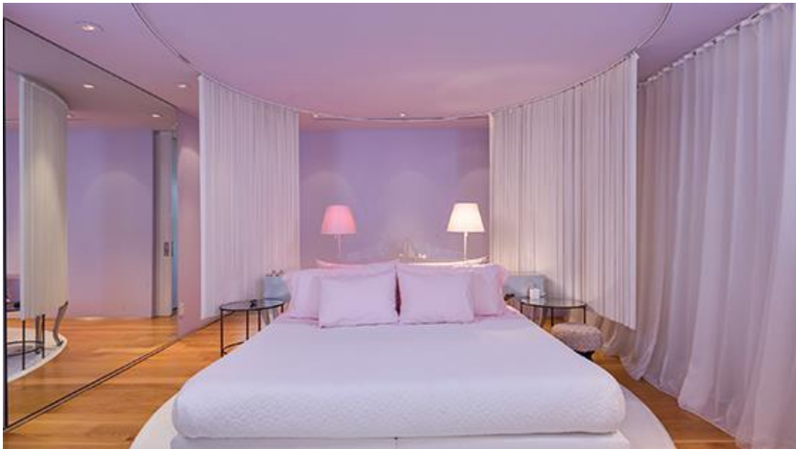
The bedroom at 2335 Eastern Canal

The three-bedroom home at 2335 Eastern Canal was just listed for $5.5 million, breaking the previous record sale price of $4.9 million along the canals. The former title holder, at 229 Linnie Canal, ended up selling at a discount to the listing price, for $4.5 million.