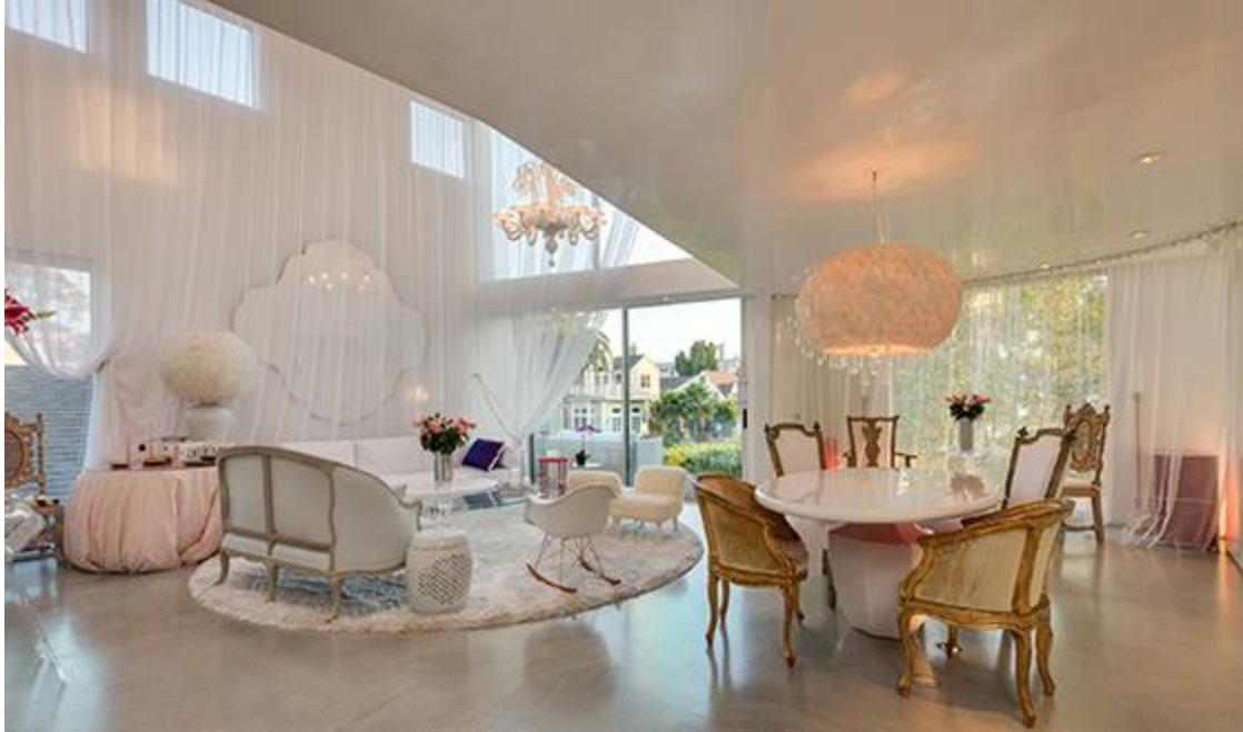
The living room at 2335 Eastern Canal

The three-bedroom home at 2335 Eastern Canal was just listed for $5.5 million, breaking the previous record sale price of $4.9 million along the canals. The former title holder, at 229 Linnie Canal, ended up selling at a discount to the listing price, for $4.5 million.