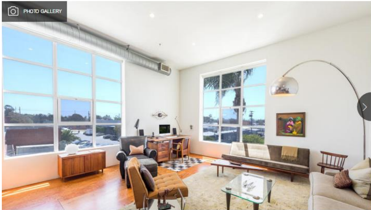
Abundant natural light pours through large, industrial windows and skylights to illuminate the art and life inside. (Nate Polta)

About the area: The median sale price for condominiums in the 90404 ZIP Code in April was $769,000, based on eight sales, according to CoreLogic. That was a 15.1% decrease in median price compared with April 2015.