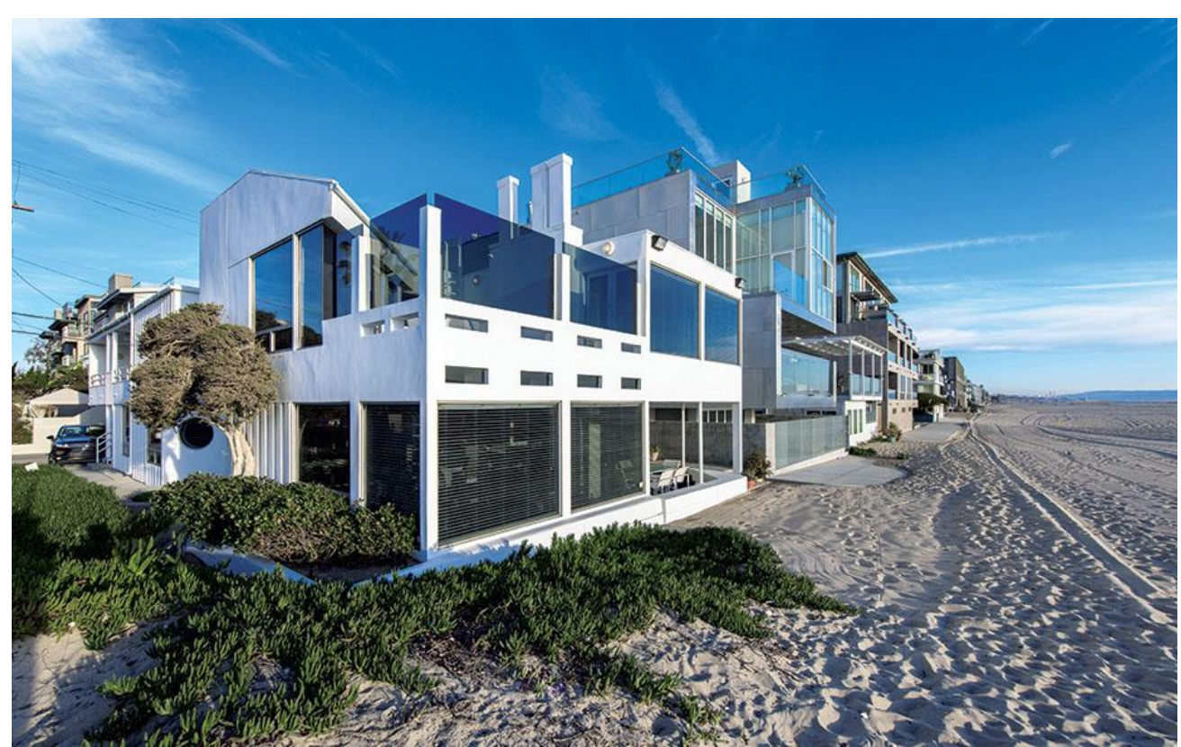
This Marina del Rey home, built in 1996, offers beachfront living without the bike path.

http://www.hollywoodreporter.com/news/los-angeles-real-estate-3-894681