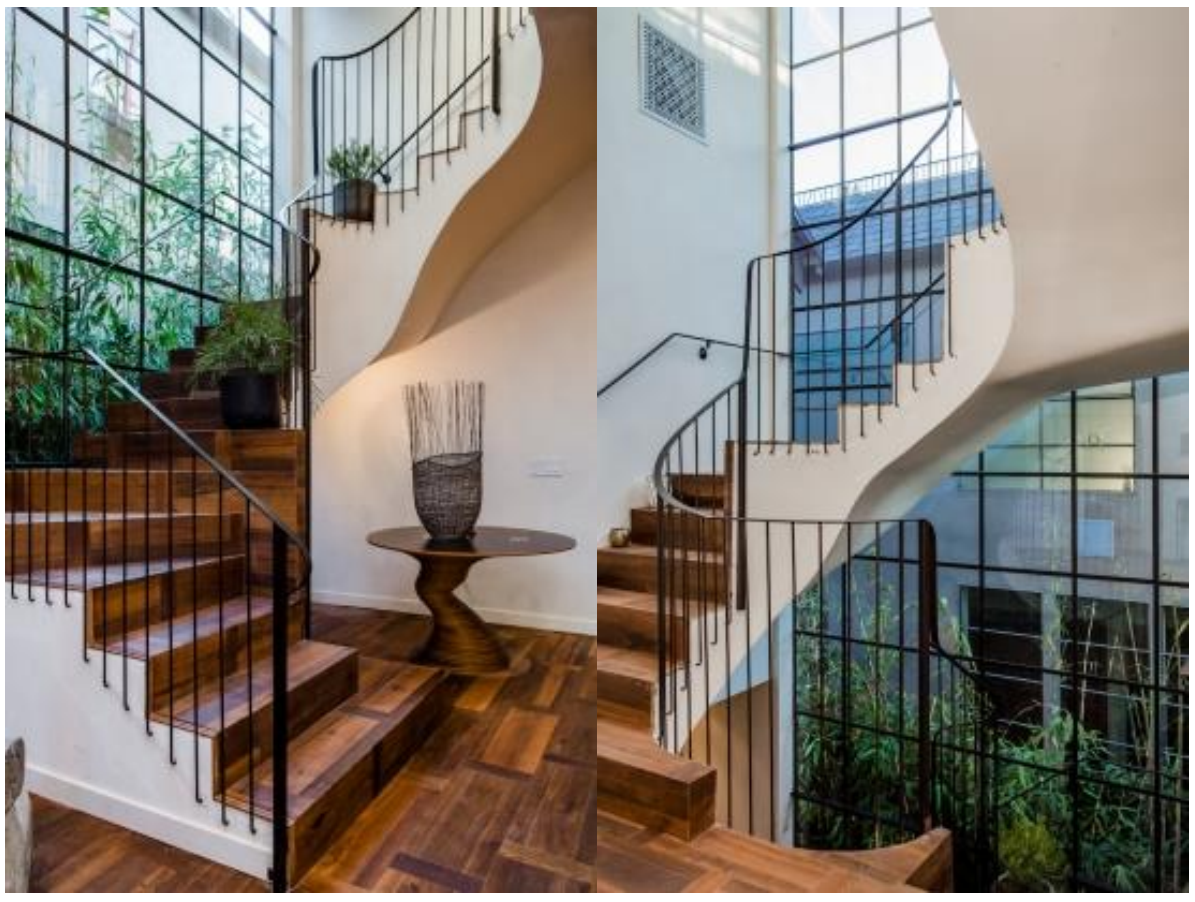
The extraordinary stair extends up to a roof terrace, and throughout the house the windows are custom wrought iron, evoking early-20th Century commercial buildings.