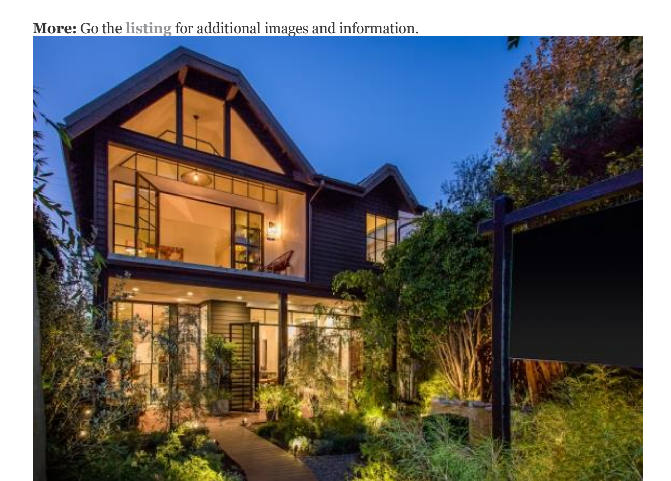
Blog Type Property

Keywords: Kim Gordon, venice, property, Open House Obsession, Venice Walk Streets